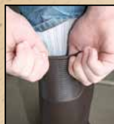
Ribbed grip for easy pull on