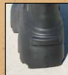
Built-in step ledge for easy boot removal