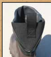
Leather loop tab and elastic back for easy pull on